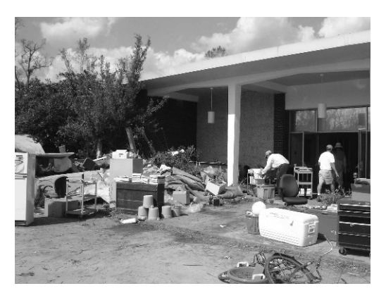
Fig. 11. Employees working after Hurricane Katrina.

Physical cleanup of flooded offices and laboratories continued for several months after the storm, and included repainting; installing new floors, doors, and cabinetry; and salvaging equipment and furniture. To be reimbursed for losses, personnel had to document and price all contents of each building that was flooded. To supplement records of items on state inventory, each person had to recall individual pieces such as chairs, office supplies, desks, and other items for which there were no records. Each item had to be documented with values located in catalogs to verify replacement costs, by the end of December 2005. Chief Financial Officer Kris Fulton worked with several FEMA Project Officers to develop project worksheets for 19 destroyed or damaged buildings for three locations, 32 projects for lost contents, and 28 projects for debris removal and infrastructure losses. About 100 computers and 40 vehicles