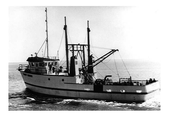
Fig. 8. R/V Tommy Munro , Gulf Coast Research Laboratory's 97-foot oceangoing research vessel.

The U.S. Marine Shrimp Farming Program was formed in 1984 to accelerate the development of a national shrimp farming program for the U.S. Department of Agriculture. Its purpose was to research, develop, and transfer technology, products, and information for the domestic shrimp aquaculture industry. The goal was to make shrimp farming competitive in world markets. Called the GCRL Consortium, it was composed of GCRL; the Oceanic Institute of Waimanalo, HI; and Tufts University of Boston, MA. The partnership was enlarged to include Texas A&M and the Waddell Mariculture Center by the late 1980s. GCRL's primary research