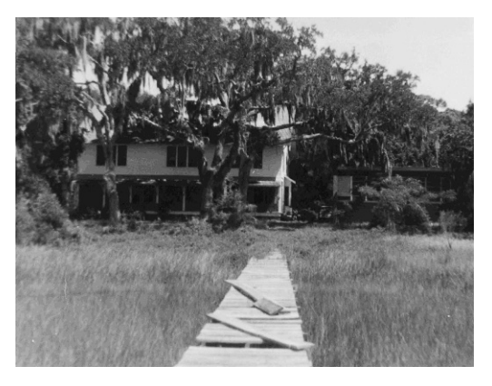
Fig. 4. Original residence on the Halstead Road property nicknamed "The Big House." It was lost in 1969 during Hurricane Camille.

And to employ staffs for the operation and maintenance of such laboratories and purposes incidental thereto; to collect and resell specimens and use the proceeds thereof to further the purposes of the corporation; to provide living facilities for staff and persons engaged in research sponsored by the corporation; to receive any and all donations made for the purposes of the corporation and to lend or give financial and instructive aid to those designated