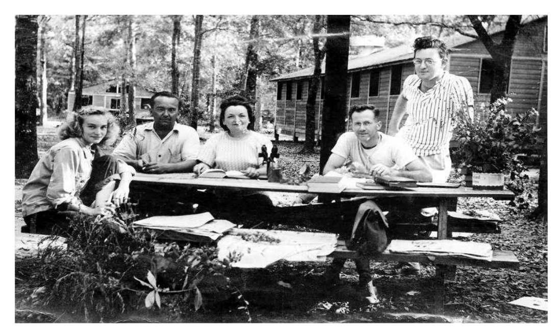
Fig. 3. A botany class held under the trees at Magnolia State Park ca. 1947.

and would become the campus now occupied by GCRL. Located 2 miles east and 1 mile south of Ocean Springs (pop. 3,000), the property, a vacation home belonging to D. A. Smart, a former editor of Esquire magazine, was nearly 40 acres between Davis Bayou and 1,600 feet of beach front with a two-story residence (affectionately nicknamed "the Big House" by lab staffers and students), a garage apartment, an artesian water well, two 36-foot boats and dock facilities, a long pier extending into the bay, and a large greenhouse (Fig. 4). A group of supporters that included Caylor, J. Fred Walker, Clyde Sheely, and others met with the chairman of the Mississippi Building Commission chairman and former governor Hugh L. White to persuade him to purchase the property for the GCRL. Their success, which came 2 yr later, guaranteed Dr. Caylor's dream and vision of a permanent GCRL.