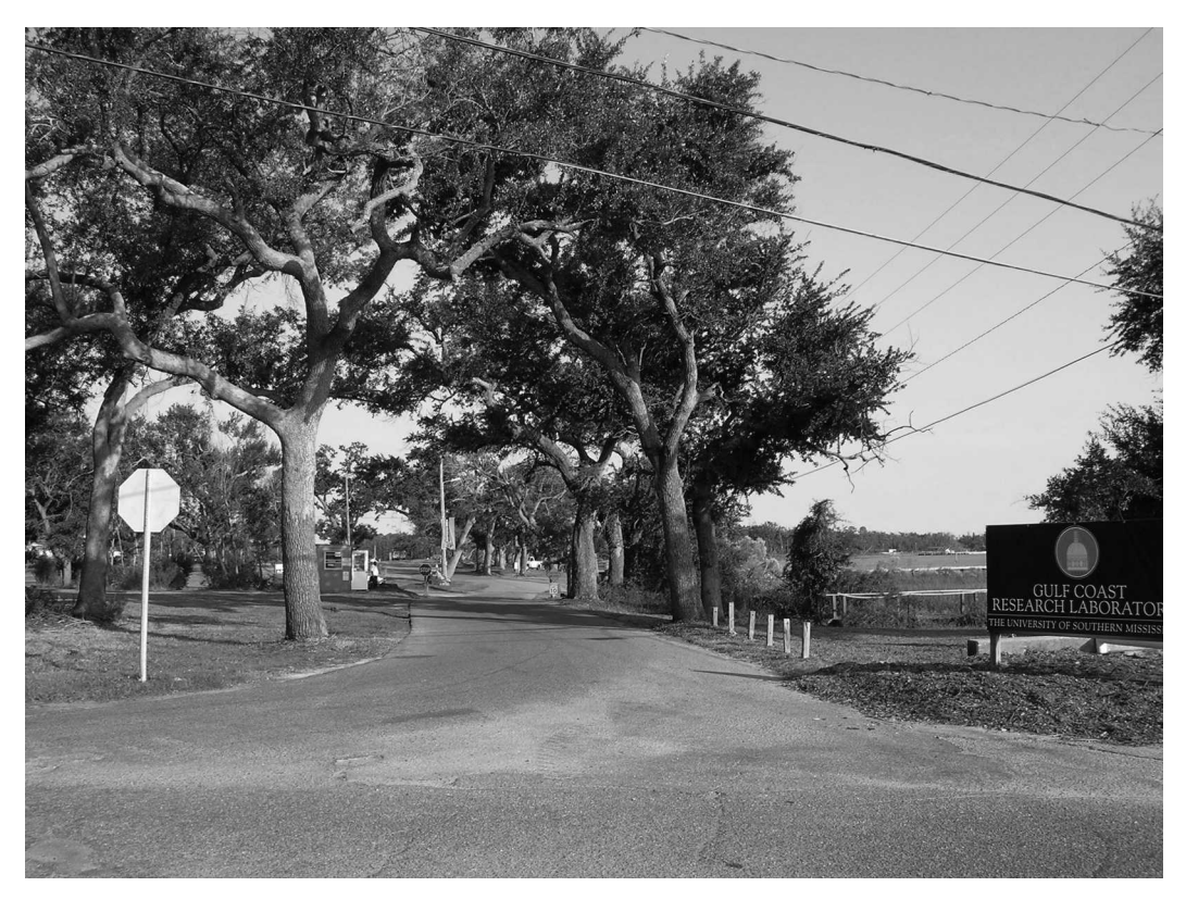
Fig. 1. Driveway onto the Gulf Coast Research Laboratory campus at Halstead Road and East Beach Drive.

well-meaning people who would lend aid and strengthen the cause. To do this, he demonstrated the need, usefulness, and practical benefits of a marine program by beginning on a small scale and promoting the results. He did this under