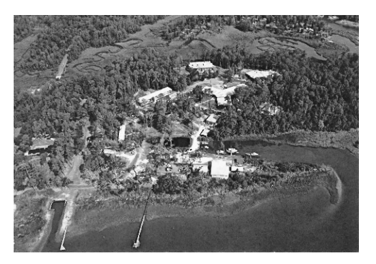
Fig. 7. Aerial view of the campus in 1971.

One of the first efforts to spread the word about the activities of the GCRL and to provide better service to the commercial and recreational fishing industry was the publication of a newsletter, Marine Briefs , beginning in May 1972. By its second year, it had become a black and white professionally written and designed monthly publication with a focus on research and people