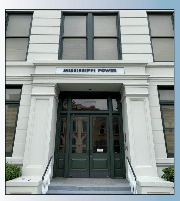
Gulf and Ship Island Building will serve as the central innovation node.